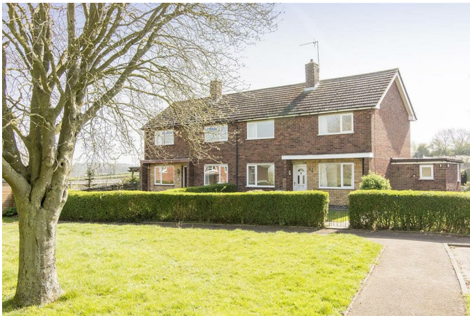
Lawned front garden with hedging. Paved pathway leading to the front entrance door.