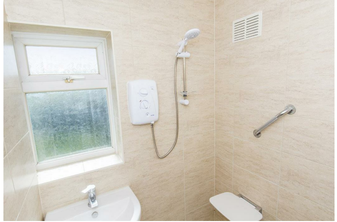
Opaque UPVC double-glazed window to rear. WC. Shower over wet room floor. Wash hand basin. Heated towel rail. Tiled walls.