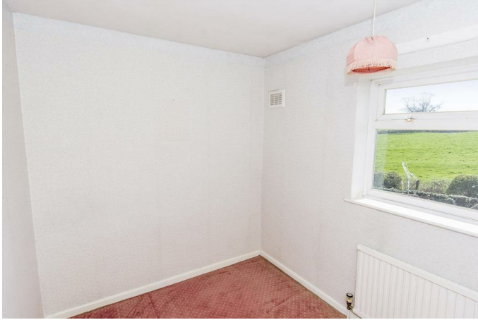
UPVC double-glazed window to rear with country views. Built in wardrobe. Radiator.