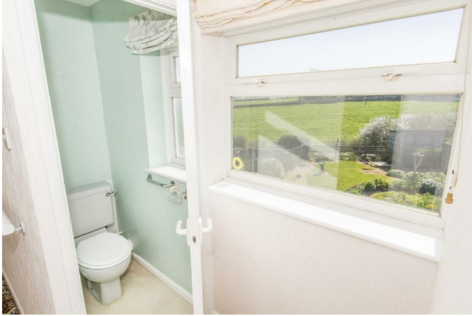
Opaque UPVC double-glazed window to rear. WC.