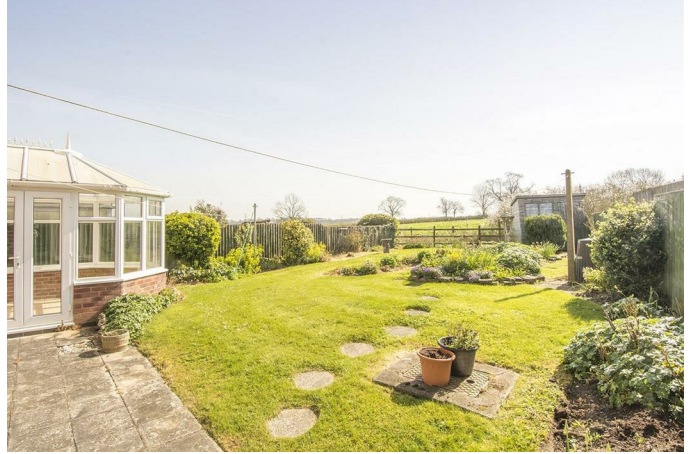
Of a good size backing on to open countryside and facing a south-easterly direction. Mainly laid to lawn. Paved patio area. Timber shed.